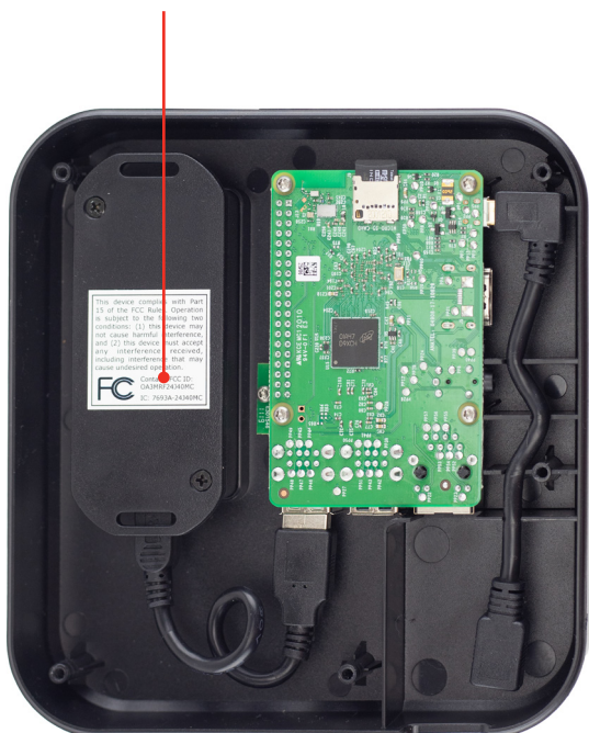
1a. Wireless Transceiver