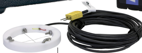
50008-K Screen Print Donut Probe with 15' cord