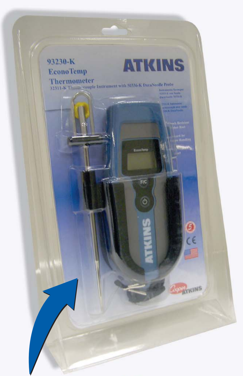
NEW Attractive Self-Stand or Hanging Clamshell Packaging!