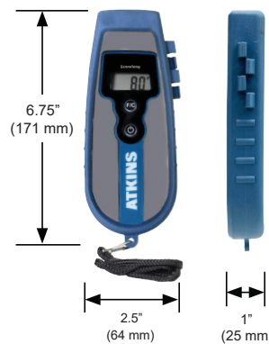
32311-K Thermocouple Instrument