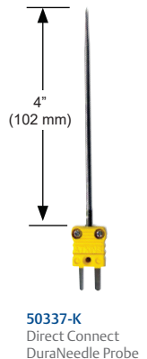
50337-K Direct Connect DuraNeedle Probe